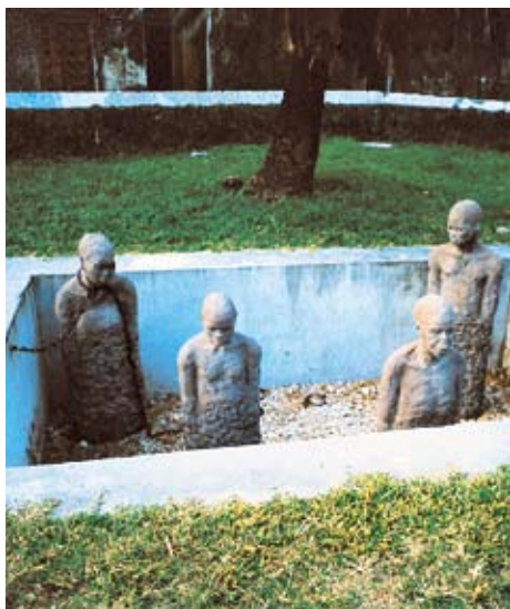
Slave monument at Anglican Cathedral

In the company of a guide, with the sounds of the evening call to prayer echoing through the narrow streets, this 2 hour walk includes many interesting shops and Fordhani Gardens where street vendors sell a variety of goods including fresh sea food and kebabs cooked on open grills. - TOUR CODE ZNZ6602