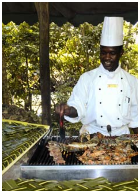
Chef at Serena Mangapwani Beach Club

The beach club offers rest rooms and changing rooms and a bar offering a variety of cool refreshments throughout the day. Self-guided and guided nature and cultural walks are available that include the nearby historical Mangapwani Slave Caves where the slaves of the 1800s were kept awaiting the monsoons and the arrival of the dhows. Transfers included. - TOUR CODE ZNZ6703