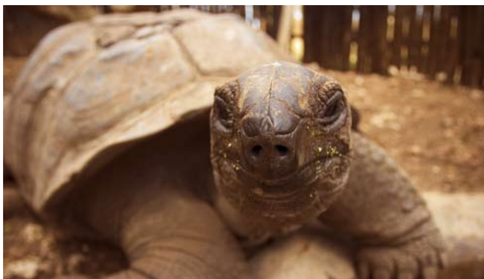
Giant tortoise on Prison Island