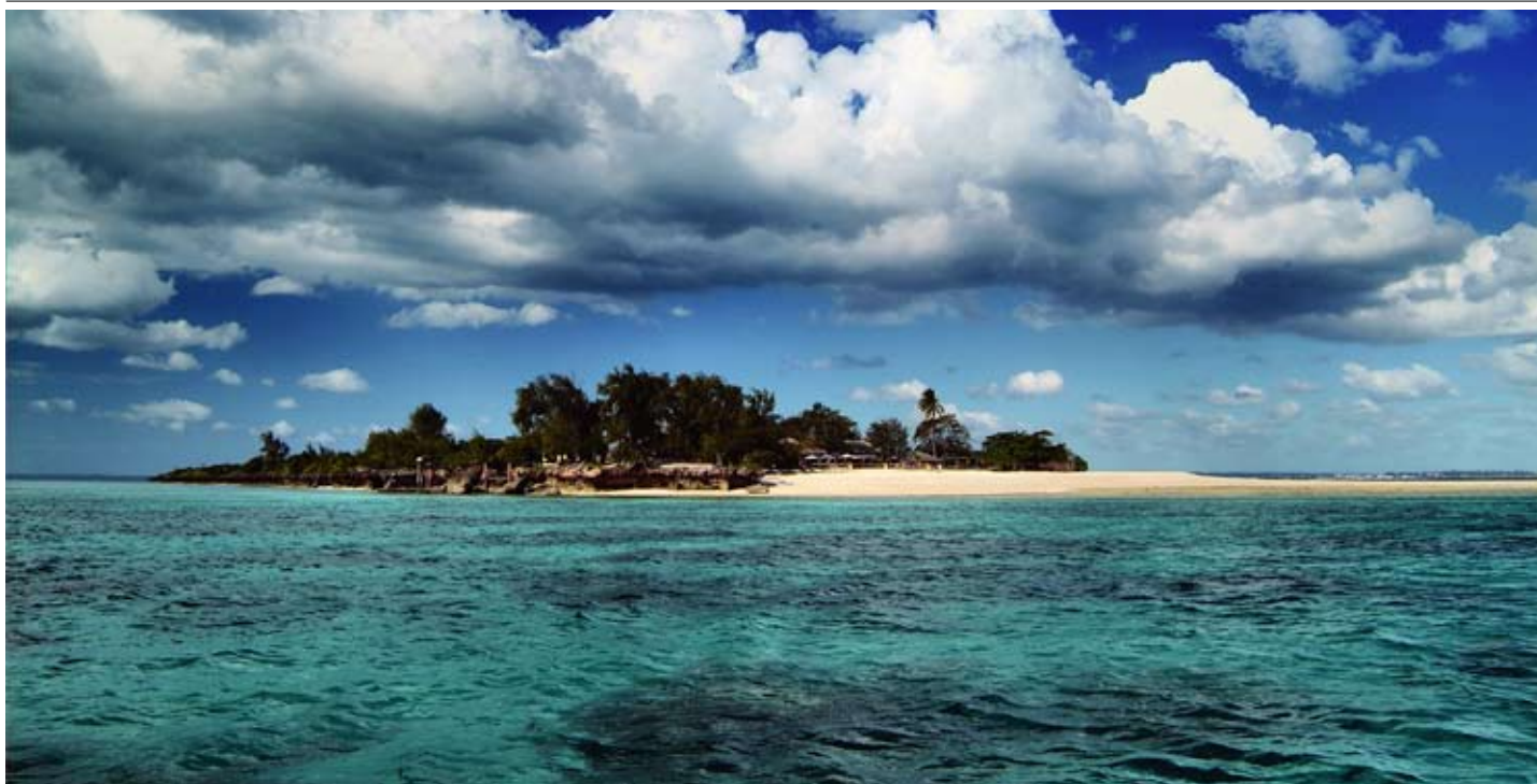
Bawe Private Island