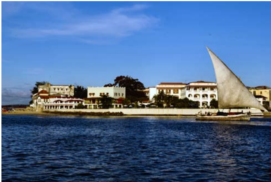
Stone Town from the Indian Ocean

After lunch relax on the sandbank listening to the hush of waves lapping against the shore or discover more underwater life around it and listen to stories from our crew about sailing the seven seas. Hop back onboard and sail to Prison Island to see the remains of the prison built to condemn Zanzibari citizens to isolation and watch the giant tortoises shuffle through the trees, with the patience that old age brings. - TOUR CODE ZNZ6704