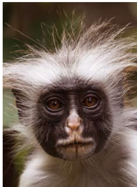
Red Colobus monkey

You will walk through the nature trail of the forest, which is a habitat for many species of animals, and birds. It is famous for its Red Colobus Monkey, the rare species. - TOUR CODE ZNZ6605