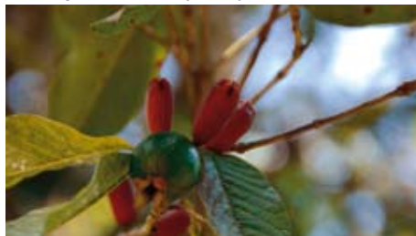
Cloves are the most popular spice on Zanzibar. The Swahili name is "Karafuu"