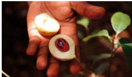
Nutmeg, one of the spices you can discover

A look at small farms in the rural area that grow cloves, vanilla, nutmeg, cardamom and many other spices, medicinal and ornamental plants, and tropical fruits. This tour provides a rare experience to prove why Zanzibar is referred to as the "Spice Island". It also includes a visit to the Persian Baths built in 1850 by Seyyid Said bin Sultan. - TOUR CODE ZNZ6604