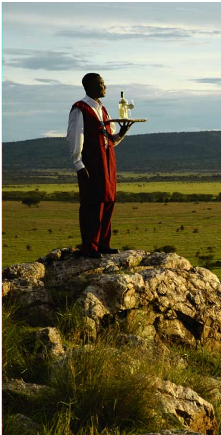
Optional sundowner can be arranged at the lodge