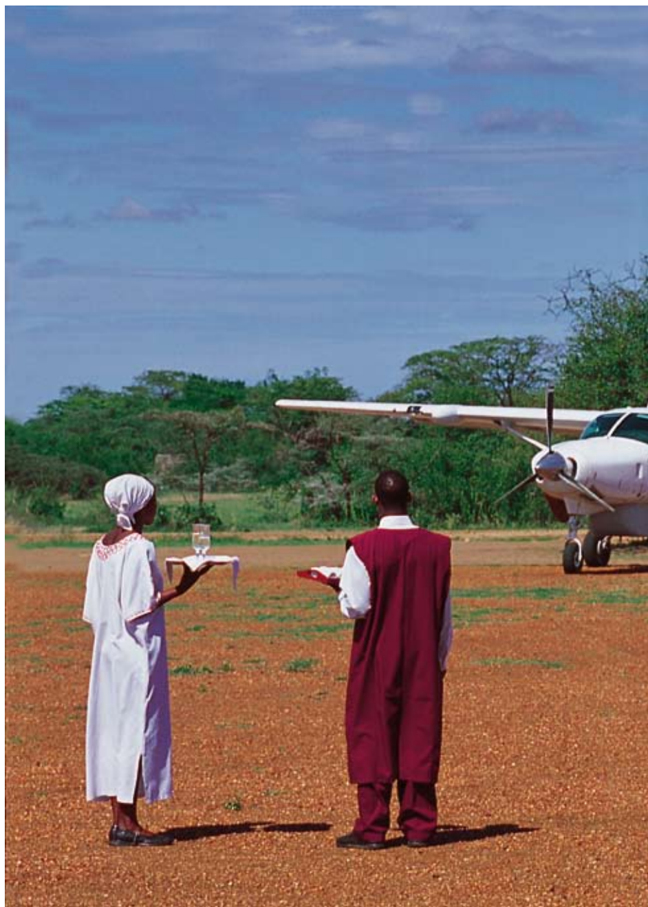
Staff of Kirawira Camp wait to greet arriving guests