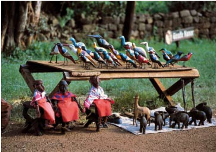
A number of crafts can be purchased at small roadside stands